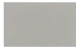
Light Seawolf Beige LT614