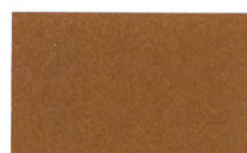
Classic Copper LT727