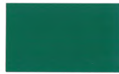
Dark Ivy LT617