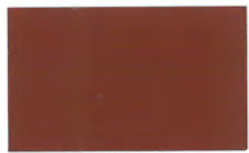
Colonial Red LT622