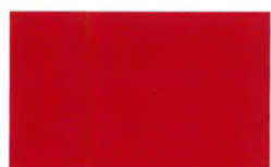
Carnival Red II LT726