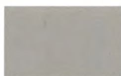
Champagne Pearl LT728