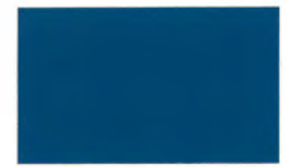
Interstate Blue LT623