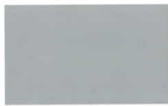
Dove Gray LT615