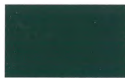
Hartford Green LT606